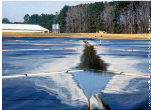
Covered lagoon digester

Other types of digester systems include covered lagoon and fixed film digesters. Covered lagoon digesters, which digest organic material at ambient temperatures, are not well suited to Minnesota's cold winter climate, when ambient temperature digestion would not be viable. Fixed film digesters require very high liquid content animal manure to work effectively. Any significant amount of solids in the incoming waste stream risks plugging, and reducing the digestion effectiveness, of these types of digesters. However, in the right situation, fixed film digesters can be beneficial because of their ability to digest organic material quicker (usually 3-5 days) than most conventional digesters, which generally need anywhere from 10-25 days to digest the organic matter.