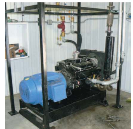
Small engine/generator system

Electricity produced through the above described process is generally used through one of two, or perhaps a combination of both, processes. First, to the extent that a farmer has a need, the electricity can be used on the farm. Using home made electricity allows a farmer to significantly cut his related utility costs. For any electricity that can't be used on site, a farmer can attempt to sell the electricity back onto the electric grid. Farmers interested in selling electricity onto the grid should contact their local utility early in the planning stages of their process to determine what type of rate they'll be able to obtain for their electricity sales.