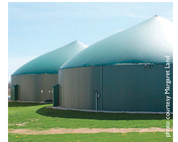
Complete mix digester

Mixed digesters combine all animal waste into one central tank and use agitation systems to mix the waste while it is digested. Sometimes, these tanks are partially buried, to take advantage of the regulated temperature below ground. Complete Mix digesters generally handle manure with 3-10% solids, and while they can be a bit more expensive than plug flow digesters, they take up a smaller footprint and are well suited for farm operations that wash out their manure.