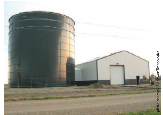
Fixed film digester