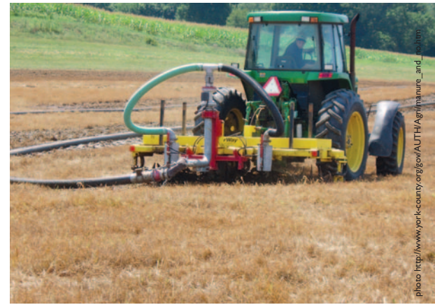
Typical liquid waste application

The other remaining component available for use after the digestion process has taken place is the liquid waste. After running through the digester this liquid waste is generally pumped to a traditional waste storage facility, such as a lagoon. Like traditional animal liquid waste, digested liquid waste may still be used for liquid fertilizer. However, this liquid waste is generally more stable and easily applicable than normal animal waste. In fact, during the digestion process, nitrogen contained in the liquid manure is mostly converted to ammonium. As most operators likely know, ammonium is the primary ingredient in commercial based fertilizers. Thus, with a more consistently uniform waste available for application, farmers are able to reduce over application, saving additional liquid waste for future application or sale to neighbors.