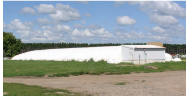
Plug flow digester

Using a plug flow digester, animal waste is introduced into one end of a long, tubular digester and moves toward the other end. As the waste is digested and flows out the tail end, more waste is introduced on the front end. Plug flow digesters have mainly been used on dairy farms, due to their ability to handle slightly higher solids contents. Plug flow digesters are workable with manure containing 11 to 13 percent solids, and are well suited for operations that mechanically scrape out manure from barns. As evidenced in the table above, the plug flow design is, of yet, the most popular anaerobic digester design.