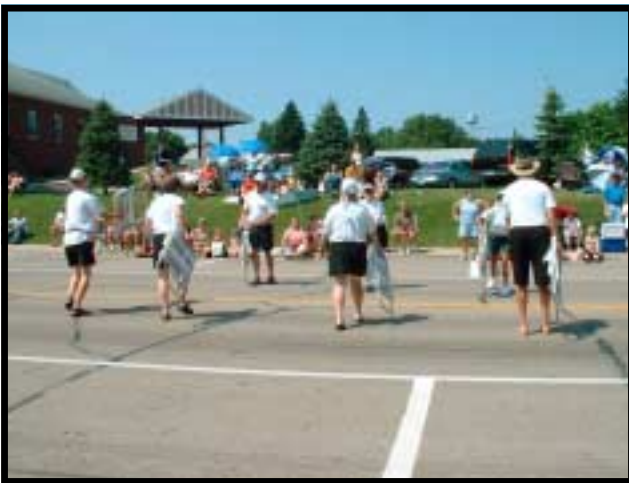
Crow River Pride volunteers in a community parade

The staff and elected officials from City of Rockford had initiated the application to the Design Team because of their interest in revitalizing the downtown area. City staff and Council found many of the recommendations helpful and moved to implement them. The City was working with the Minnesota Department of Transportation on the future of highway 55 and continued to address highway design and redevelopment issues. Comprehensive planning is also a City responsibility, and the City has begun to update their plan.