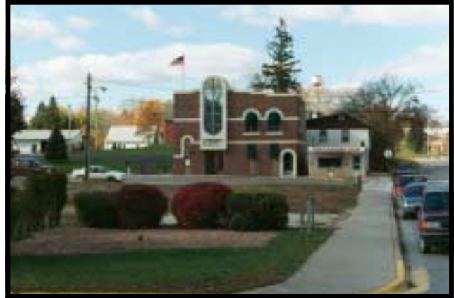
Vacant lot in downtown Rockford