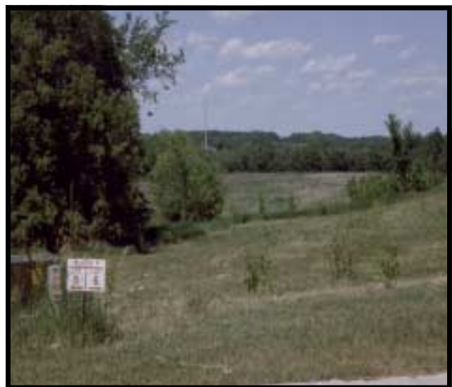
Greenfield open field for development

Citizens from both Greenfield and Rockford Township have continued their involvement in Crow River Pride and in community activities, but neither local government has done much to implement Design Team recommendations. The City of Greenfield local elected officials were not interested in most of the Design Team recommendations for their community. The Design Team stressed cluster development and preservation of open space. The Mayor and at least one other Council member were developers, and the large lot, large home developments were the preference of the majority of the City Council. Rockford Township had little sense of urgency about development issues and, as a township, little capacity to address them.